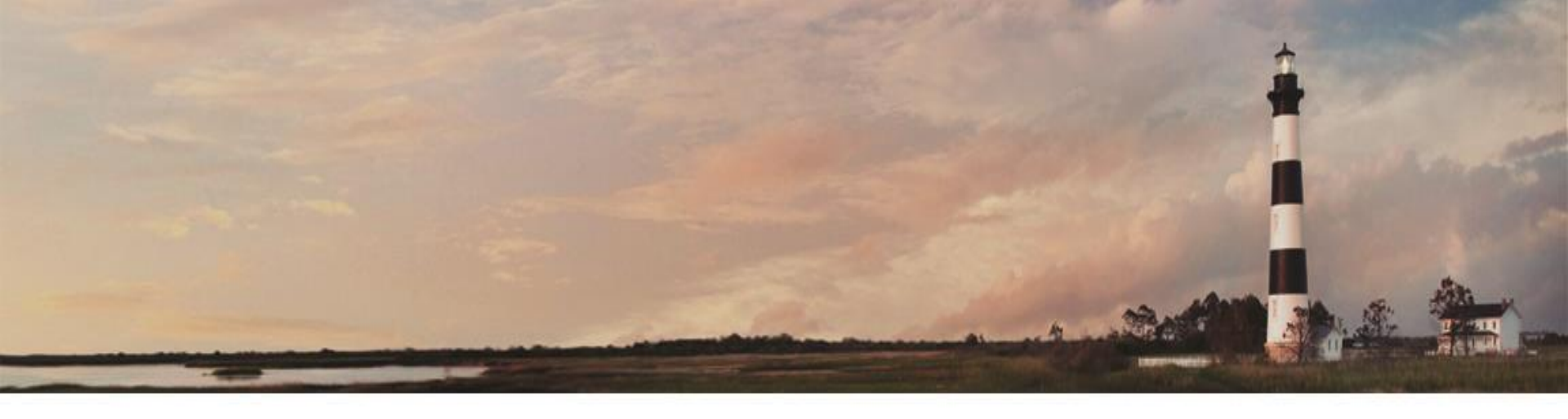
February 7, 2024

Administering SL 2023-134 Direct Appropriations for Water and Wastewater Projects Department of Environmental Quality Division of Water Infrastructure